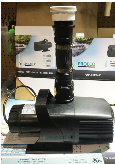
connection assembly threads on pump