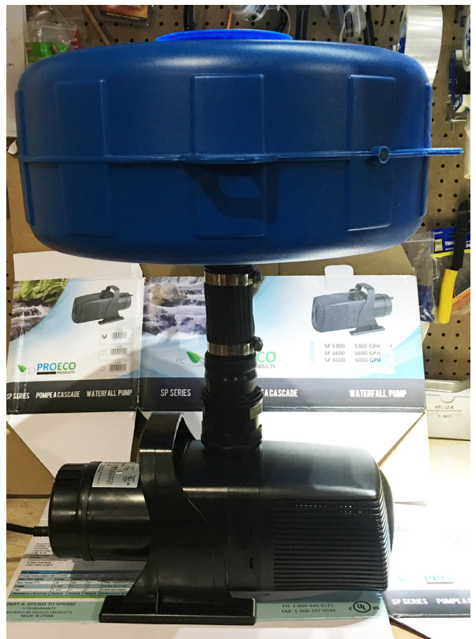
Thread float onto connection assembly